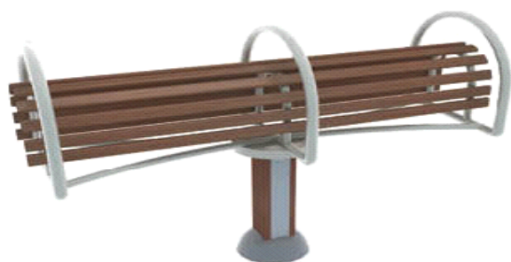
THJ-W35(B/T) 腰背伸展器 Back Stretcher Dimension:1350x590x1080mm