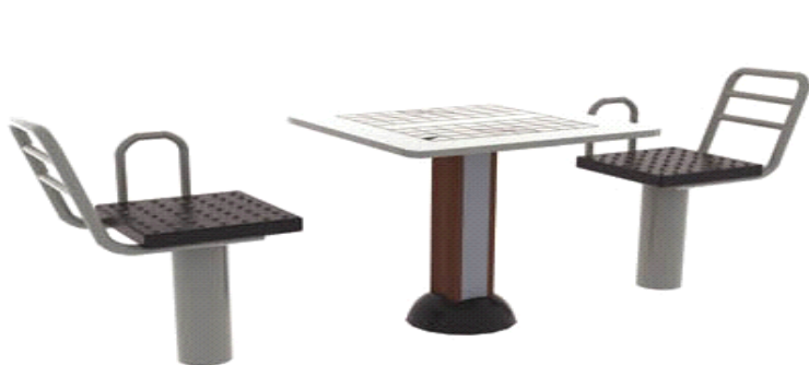
THJ-W33(T) 棋牌桌 Chess Table Dimension :1860x700x860mm