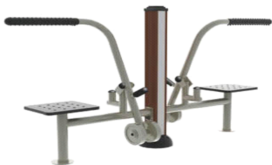
THJ-W19(T) 背部按摩器 Back Massager Dimension:1800x1230x1520mm