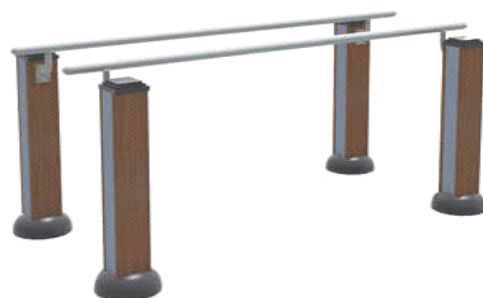
THJ-W40(B/T) 双杠 Parallel Bars Dimension:2620x990x1450mm