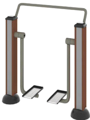
THJ-W01 (B/T) 单位漫步机 Air Walker Dimension: 1124x570x1440mm

T series: the middle main post is of WPC, the function equipments on both sides are of Q235 carbon steel, which can be painted different colors accordingly.