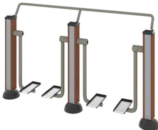
THJ-W02 (B/T) 双位漫步机 Air Walker (Double) Dimension: 2124x570x1440mm