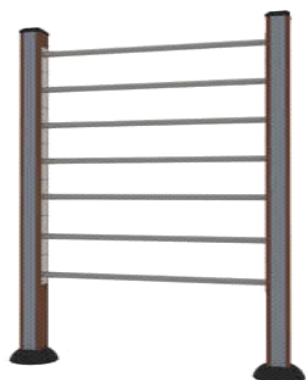
THJ-W43(T) 肋木架 Wall Bars Dimension:1324x124x2420mm