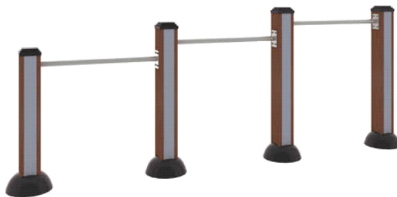
THJ-W38(B/T) 三位压腿器 Leg Pliability Apparatus(Three-unit) Dimension:2296x124x1380mm