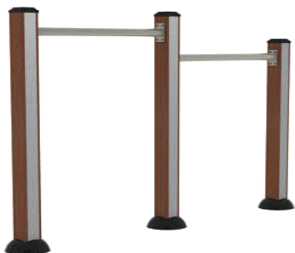
THJ-W39(B/T) 单杠 Horizontal Bar (Double-unit) Dimension:2772x124x2920mm