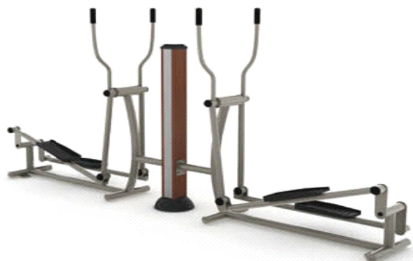
THJ-W20(T) 双位椭圆机 Elliptical Trainer (Double) Dimension:3180x560x1620mm