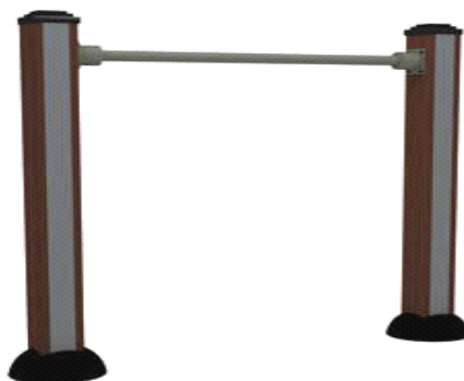
THJ-W32(T) 手腕练习器 Wrist Trainer Dimension: 1324x124x1330mm