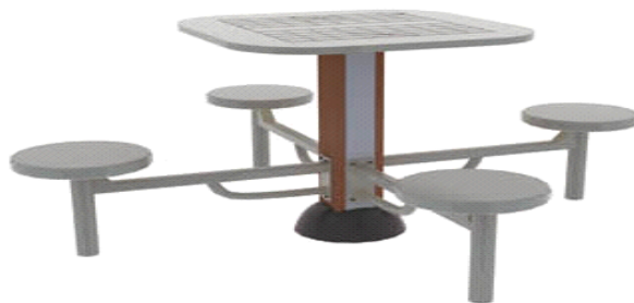
THJ-W44(T) 棋盘桌 Chess Table Dimension:1760x1760x900mm