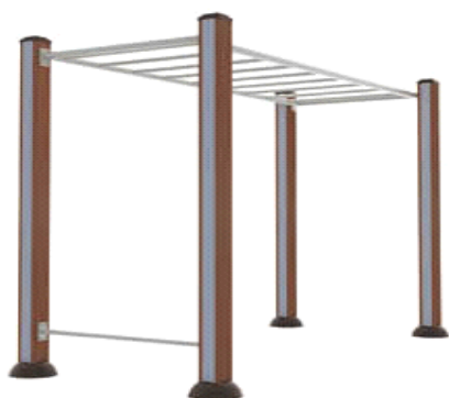
THJ-W41(T) 天梯 Horizontal Ladder Dimension:3045x1100x2520mm