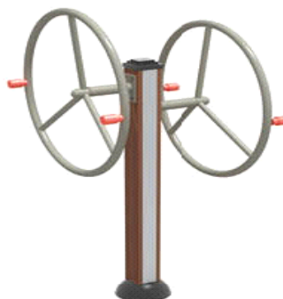
THJ-W04(B/T) 双位大转轮 Arm Wheel Dimension: 927x908x1520mm