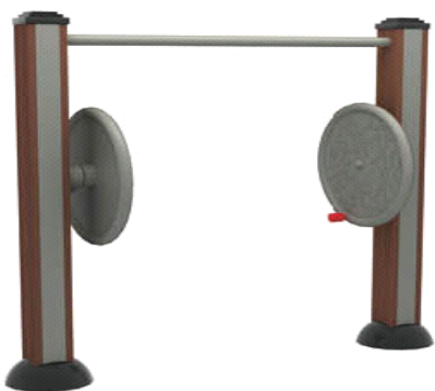
THJ-W31(T) 上肢练习器 Upper Limb Trainer Dimension: 1830x432x1680mm