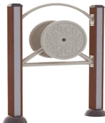
THJ-W42(B/T) 臂力训练器 Leg Massager Dimension:938x460x1880mm