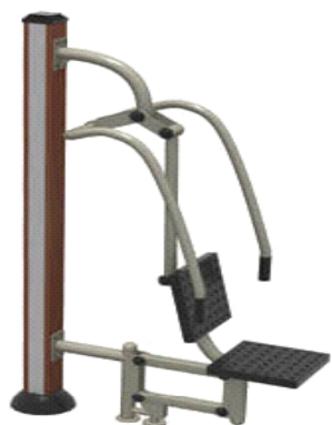
THJ-W13(B/T) 单位坐推器 Push Chair Dimension: 1460x650x1920mm