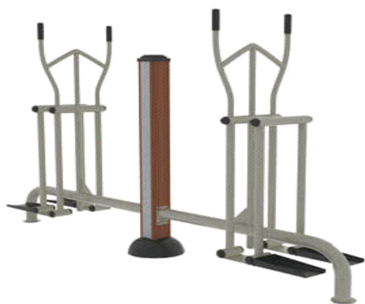
THJ-W27(T) 双位平步机 Walking Machine (Double) Dimension: 3150x560x1620mm