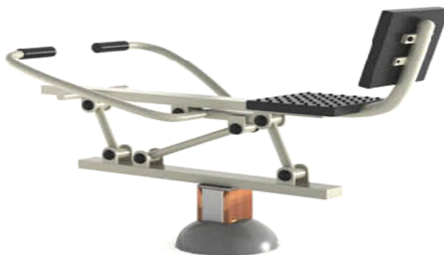
THJ-W26(T) 划船器 Rowing Machine Dimension: 1350x880x1050mm