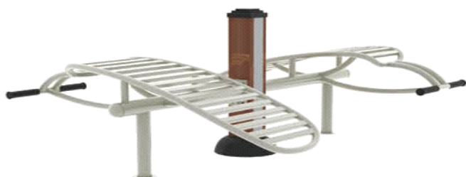
THJ-W03(B/T) 双位腹肌板 Web Board Dimension: 1430x1225x820mm