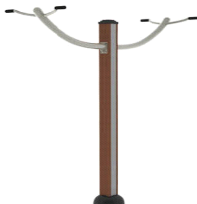
THJ-W22(B/T) 双位引体架 Pull up Bracket Dimension: 1670x785x2270mm