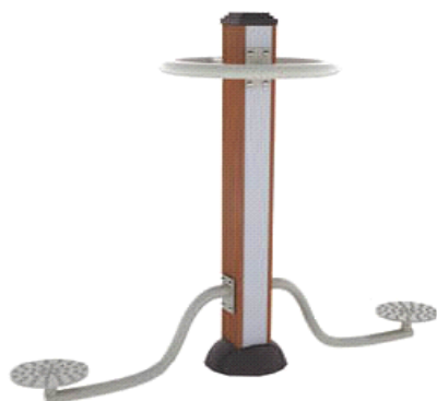
THJ-W05(B/T) 双位扭腰器 Waist Trainer Dimension: 1716x692x1400mm