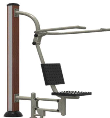
THJ-W14(B/T) 单位坐拉器 Pull Chair Dimension: 1250x742x1900mm