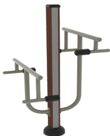
THJ-W23(T) 压腿器 Leg Pliability Developer Dimension: 1570x1050x1820mm