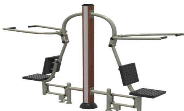
THJ-W16(B/T) 双位坐拉器 Pull Chair (Double) Dimension:2250x742x1900mm