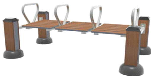
THJ-W37(B/T) 鞍马训练器 Pommel Horse Apparatus Dimension:1810x724x675mm