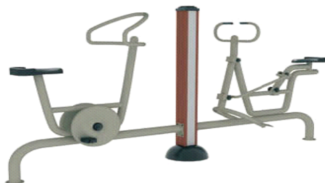
THJ-W28(T) 健骑机、健身车 Bonny Rider & Bicycle Dimension: 2480x620x1620mm