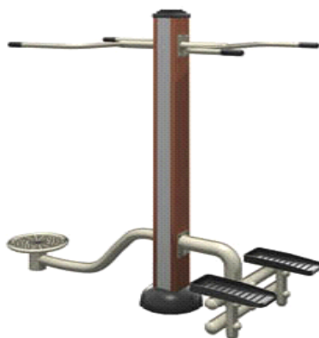
THJ-W12(B/T) 扭腰踏步器 Waist Trainer & Step Apparatus Dimension: 1263x692x1520mm