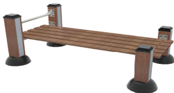
THJ-W36(B/T) 仰卧起坐平台 Sit-up Bench Dimension:2224x850x780mm