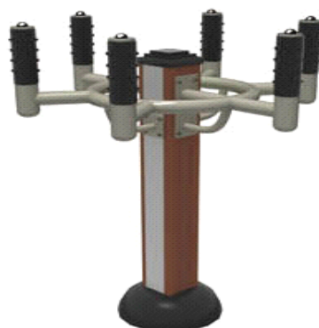
THJ-W34(T) 腕部按摩器 Wrist Massager Dimension:φ870x1060mm