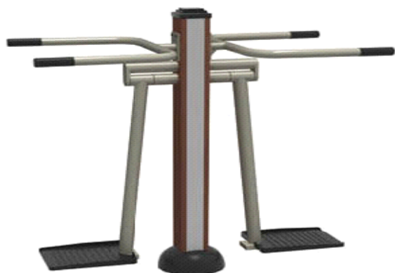
THJ-W09(B/T) 钟摆器 Surfboard Dimension: 1150x742x1460mm