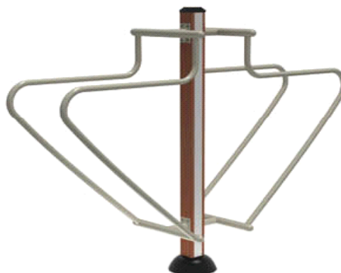
THJ-W08(B/T) 双位立撑架 Exercising Bars Dimension: 2390x720x1900mm