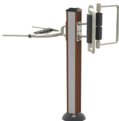
THJ-W07(B/T) 腰背按摩器 Waist & Back Massager Dimension: 1320x780x1630mm