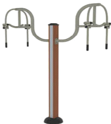
THJ-W25(B/T) 上肢牵引器 Arm Extension apparatus Dimension: 1530x1050x1490mm