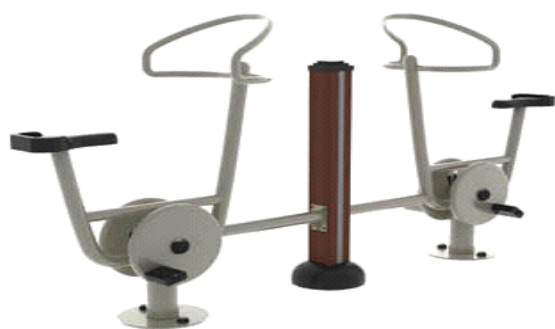
THJ-W29(T) 双位健身车 Bicycle (Double) Dimension: 1550x620x1620mm