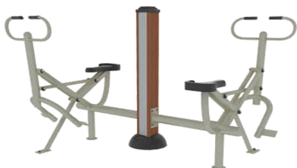
THJ-W21(T) 双位健骑机 Tonny Rider (Double) Dimension: 1750x1400x1620mm