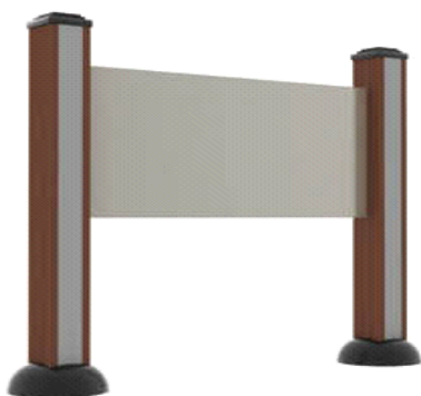
THJ-W17(B/T) 告示牌 Notice Board Dimension :620x550x1650mm