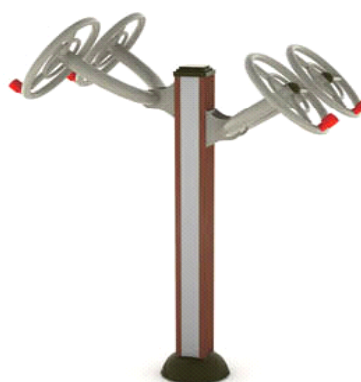
THJ-W06(B/T) 双位太极轮 Tai Chi Wheel Dimension: 1335x950x1580mm