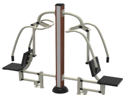
THJ-W15(B/T) 双位坐推器 Push Chair (Double) Dimension:2370x650x1920mm