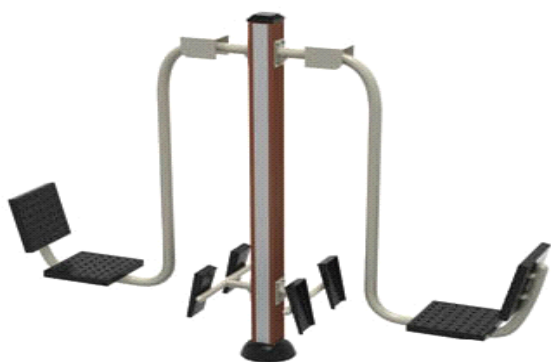
THJ-W11(B/T) 双位坐蹬器 Leg Stretcher Dimension: 2350x485x1920mm