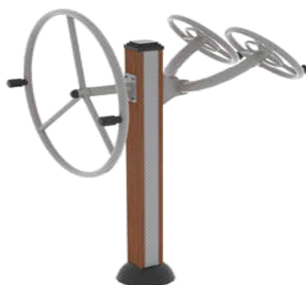
THJ-W24(T) 大转轮、太极轮 Arm wheel & Taichi wheel Dimension: 1960x935x1920mm